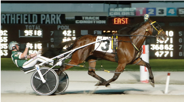
This Is The Plan

This Is The Plan etched himself into harness racing history books as the fastest horse to ever win on a half-mile track when he won the $200,000 Battle of Lake Erie in 1:47.3 at MGM Northfield Park June 5.