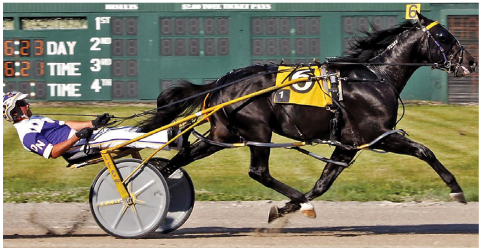
Heart of Chewbacca