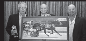
Let's Get Started, 2-Year-Old Trotting Filly of the Year won the 2016 Ohio Horse of the Year!

Join us to celebrate 2017 at the OHHA Annual Awards Banquet on Saturday, January 13 th , at the DoubleTree Worthington. The USTA District 1 and OHHA member meetings and First Lady's Luncheon are also January 13 th .