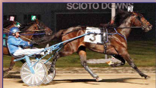
2014 Ohio Sires Stakes Champion NEELY'S MESSENGER 3,1:55.3f ($354,665)