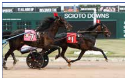
Cover photo: Like Old Times at the Ohio Breeders Stakes