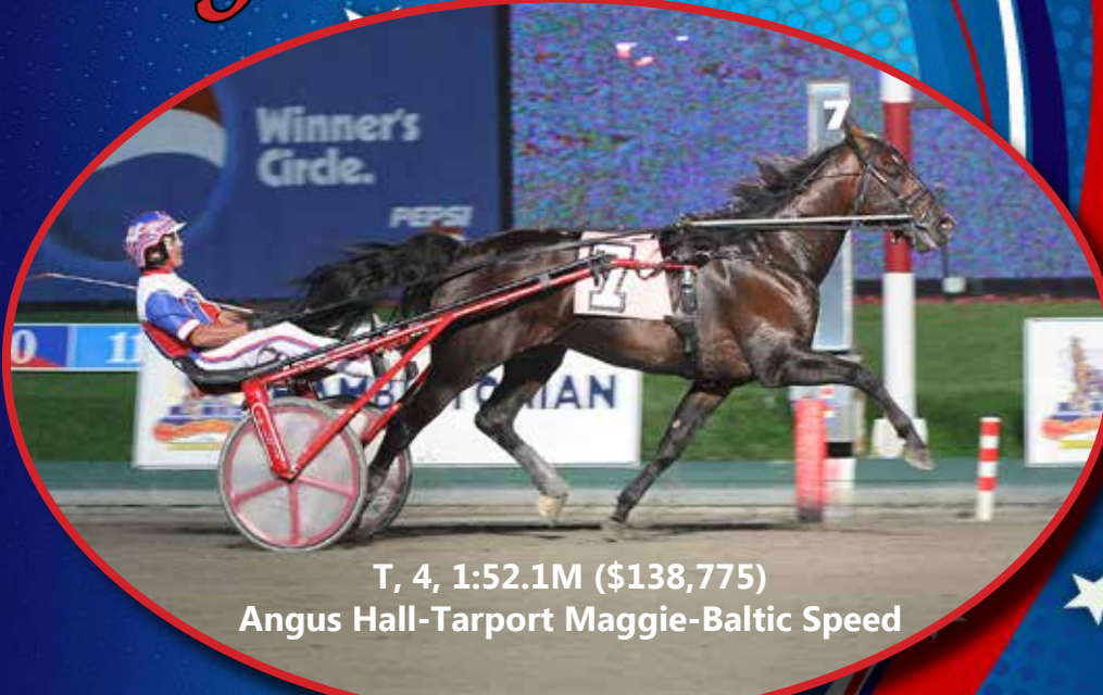
T, 4, 1:52.1M ($138,775) Angus Hall-Tarport Maggie-Baltic Speed