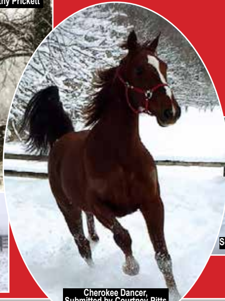
Cherokee Dancer