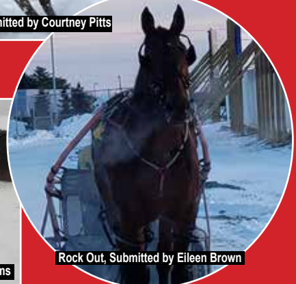
Rock Out