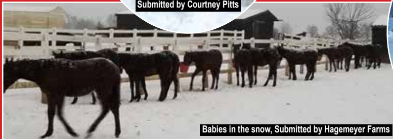
Babies in the snow, Submitted by Hagemeyer Farms