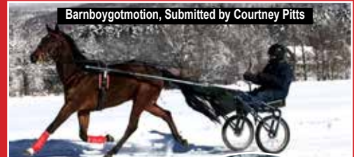
Barnboygotmotion, Submitted by Courtney Pitts