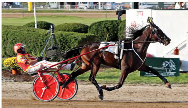
Designer Specs - OFRC Two-year-old filly trot champion

An undefeated two-year-old and a couple of repeat winners highlight the 2020 Ohio Racing Conference champions for 2020.