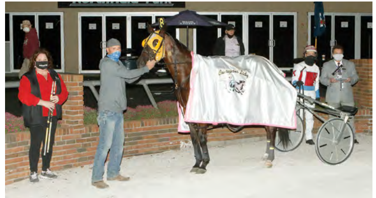
Drama Act

Drama Act overcame post-8 to prevail against Grand Circuit stock in the $120,000 Courageous Lady at MGM Northfield Park on Oct. 17.