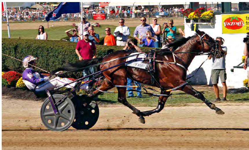
Lost For Words

Lost For Words, the 2015 Little Brown Jug runner-up is headed to Ireland where he will stand for the 2021 breeding season.