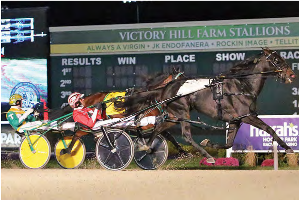
Kissin In The Sand wins the Breeders Crown