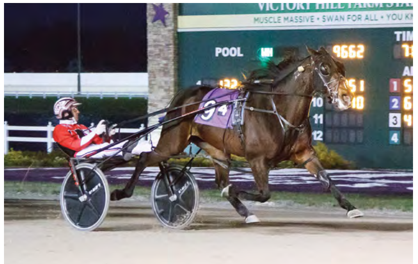
Miss You N