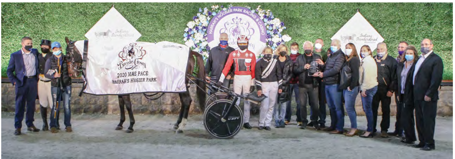
Breeders Crown Champion Kissin In The Sand

“I really like where I am right now,” he said. “It’s really exciting to watch the horses race. I really love following them around.”