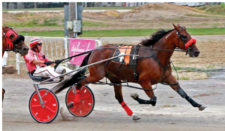
Sweet Oliver was the top OFRC point earner in 2020