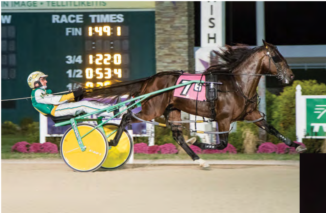
Catch the Fire

On Saturday night of the Breeders Crown at Hoosier Park the undercard of seven races was dominated by Ohio connections.