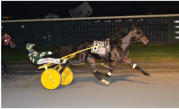
Southwind Gendry with Yannick Gingras

On Nov. 6 at Hoosier Park, two of the top three finishers in the $160,000 Monument Circle Pace had Ohio connections.