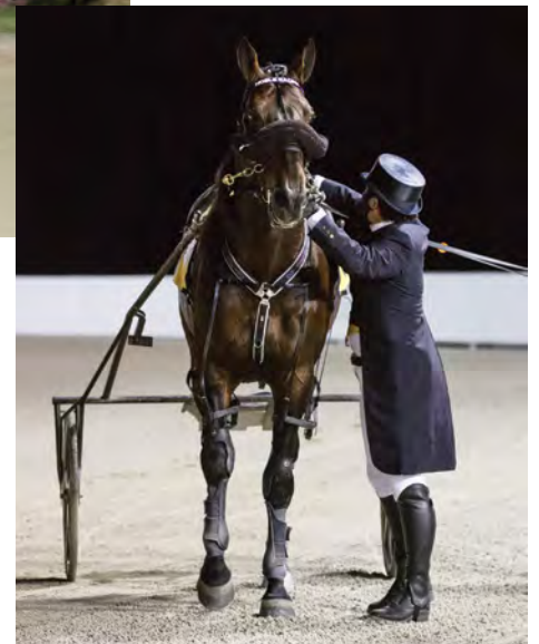
Stars Align A