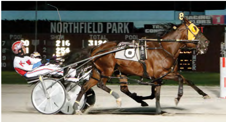
Drama Act wins the Courageous Lady at MGM Northfield Park