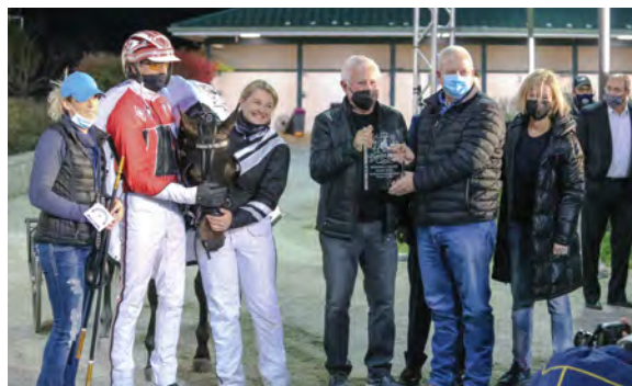
Kissin In The Sand's connections celebrating the victory