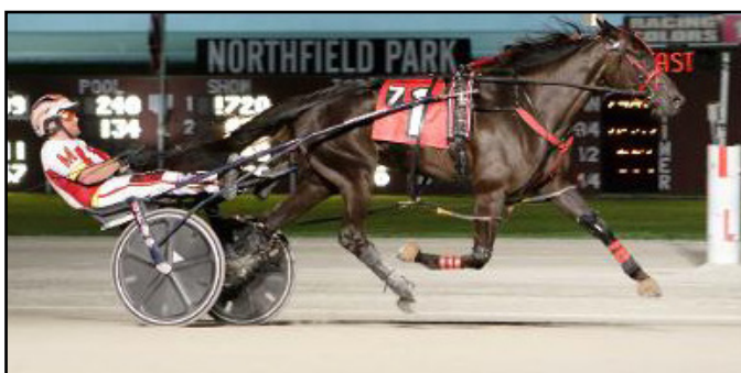
GABBYS C NOTE 2-Year-Old Filly Trotting Champion