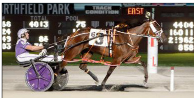
SMOOTHASTENESEWISKY 3-Year-Old Filly Pacing Champion