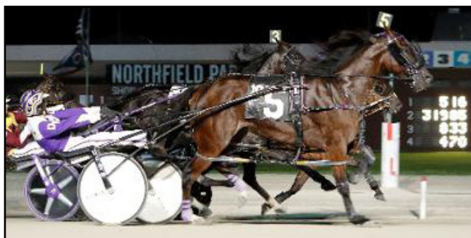
BORNTOBESHAMELESS 3-Year-Old Colt Pacing Champion