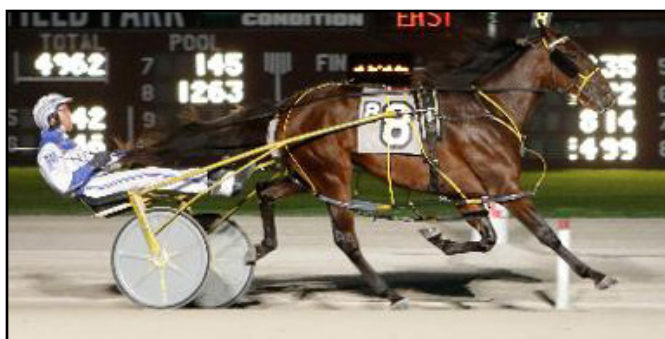
SEA SILK 2-Year-Old Filly Pacing Champion