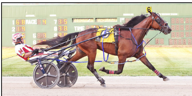
WINNING TICKET 3-Year-Old Colt Trotting Champion