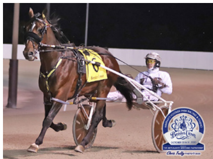
Summa Cum Laude to stand at Midland Acres

World Champion Guardian Angel AS will stand the 2022 breeding season at Autumn Lane Farm in Thornville, Ohio. Guardian Angel AS earned over $1.5 million dollars during his racing career, taking a mark of 1:50.1 as a 6-year-old. The son of Archangel will be the fastest and highest money winning trotting sire standing in Ohio.