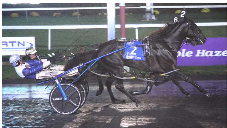
Monte Miki holds off Gulf Shores