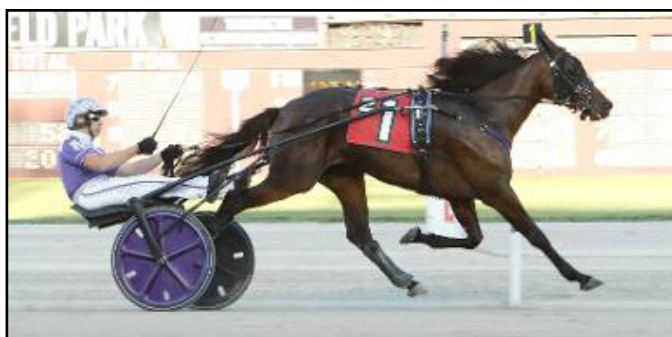
HERCULISA 3-Year-Old Filly Trotting Champion