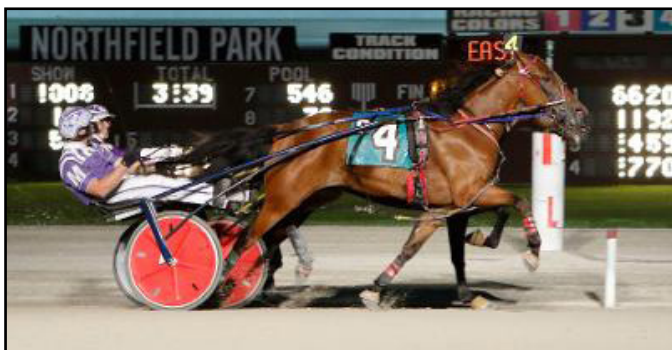
THE MIGHTY HILL 2-Year-Old Colt Trotting Champion