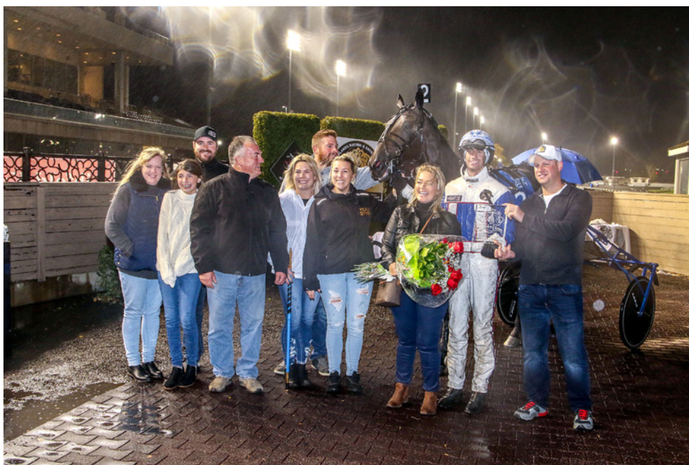
The Monte Miki winners circle celebration