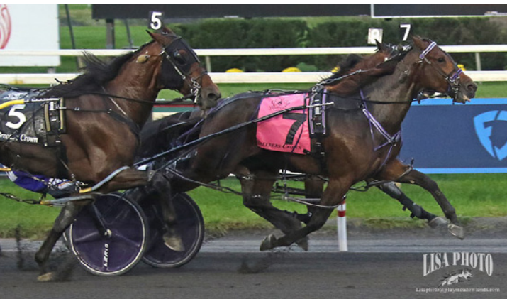
Ocean Rock surges to the win

Noble described the feeling as "unbelievable" as he crossed the finish line with