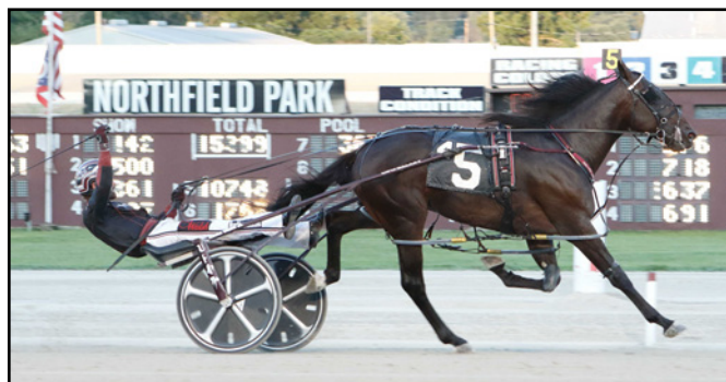
GULF SHORES 2-Year-Old Colt Pacing Champion