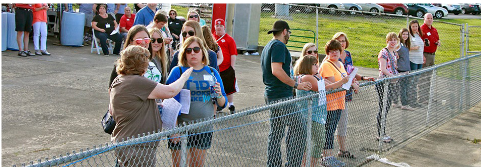
The charities enjoyed watching races even prior to their race.

Due to the generosity of Ohio horsemen, this has become an annual event that the OHHA looks forward to offering. Any charity interested in participating next year, send an email to rmayhugh@ohha.com with your contact information or call the OHHA office at 614-221-3650.