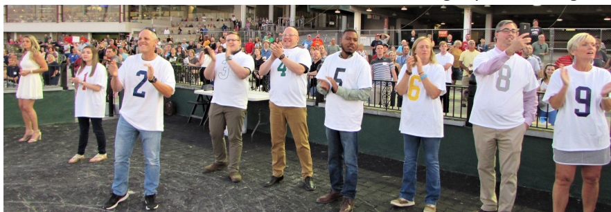
The excitement as the charities cheer on their horses.