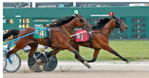
Majestic Lexi on June 7 at Eldorado Scioto Downs