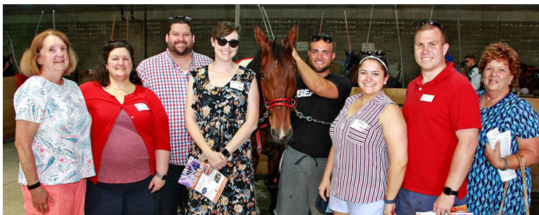
ALS met their horse Blooming Genius in the paddock

with Big Brothers Big Sisters for many years. This year he attended with Tread Lightly, a new charity to the event.