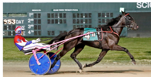
Workintonbroadway on June 21 at Eldorado Scioto Downs