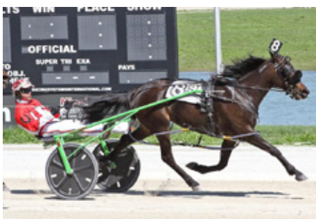
Pompatus of Love

As the Buckeye Stallion Series heads to the dog days of summer, double winners have highlighted the early legs.