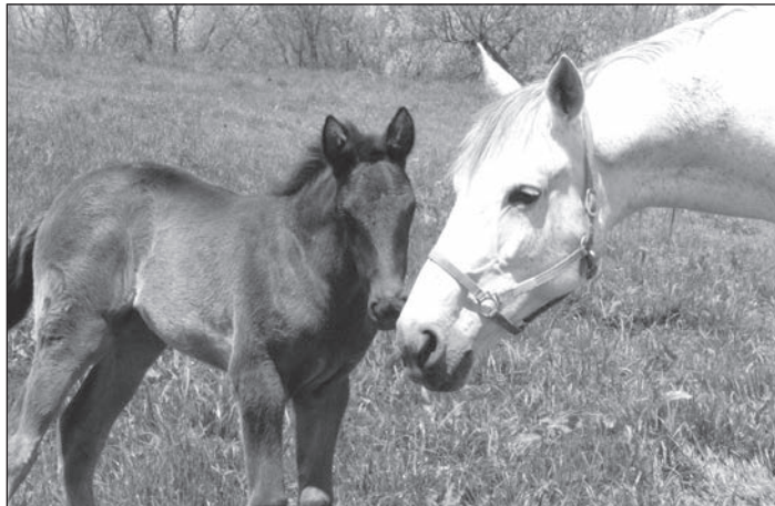
Candemonium and her 2016 Woodstock filly - 2016

The first four stallions to stand at Sugar Valley Farm were Woodstock (Rocknroll Hanover-Gothic Lady-Abercrombie), Mr Wiggles (Bad-