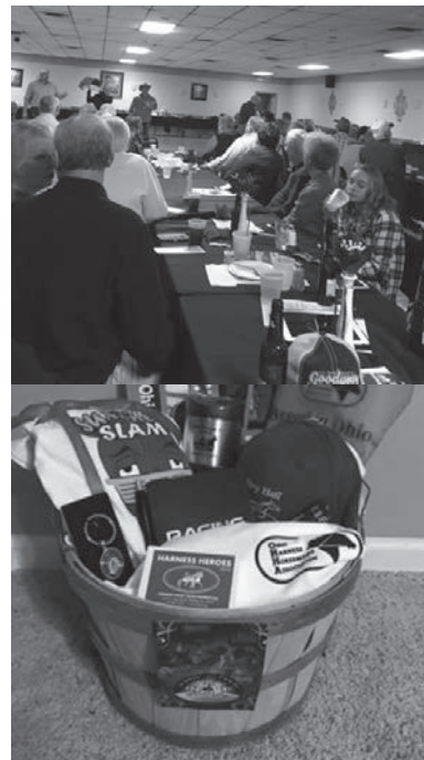
Top, horsemen enjoy the MCHHA Annual Banquet. Bottom: one of many auction items of the evening.

MCHHA will also be hosting a matinee this spring, date to be determined.