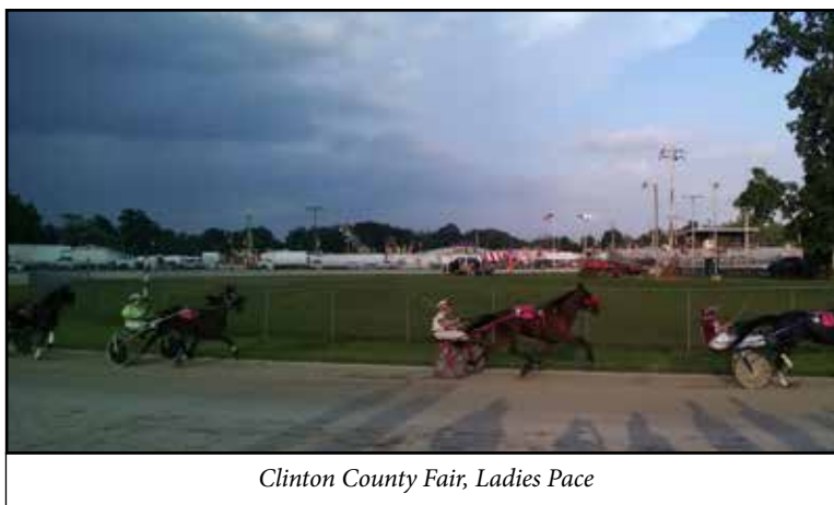
Clinton County Fair, Ladies Pace