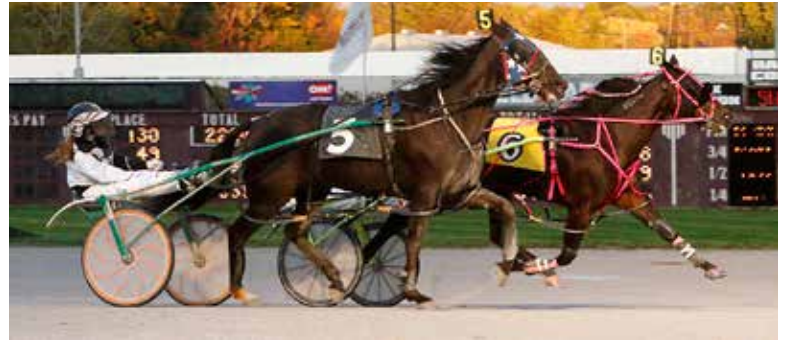
Northfield Park's Pace for the Cure, October 16, 2015

Special Thank You to Northfield Park for Hosting "Pace for the Cure" as part of their Pinktober Campaign! "The Pace for the Cure" featured all lady drivers. Northfield Park generously donated flowers and a buffet for two to each of the lady drivers. A special thank you to the ladies as well for their donation to Northfield Park's Pinktober Campaign, an event that Northfield Park holds every day in October to support local cancer fighting efforts, with money being raised to benefit the Susan G. Komen Northeast Ohio.