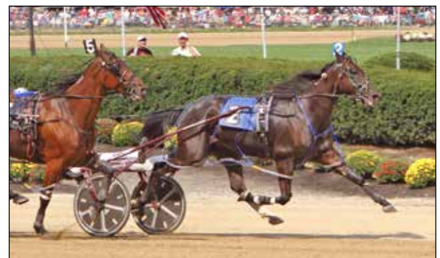
Mystical Rock, Signature Series Pacing Champion.