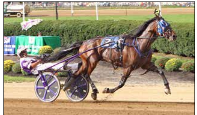
Rockinthepines, Signature Series Trotting Champion.

The Signature Series would like to thank our sponsors who make this a great and competitive series for older horses at fairs with great cash awards and excellent purses for the finals at Delaware each year. Please visit our website and support our sponsors: the Ohio Harness Horsemen's Association, the Blooded Horse Sales Company, AWS Stables, Midland Acres, D&D Ingredient Distributors, Hickory Lane Farm, MWI Animal Health, Cool Winds Farm, Hagemeyer Farm, Sugar Valley Farm and Spring Haven Farm.