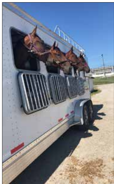
Loaded up & heading to the races for Bret Schwartz & the Hired Gun Racing Stable