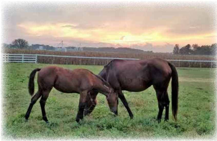
Kitty Kitty Bang with a Nob Hill High Filly.