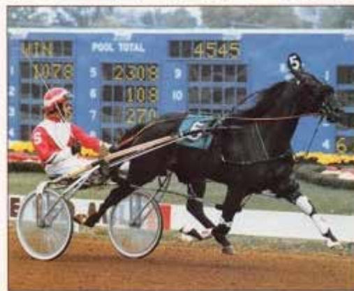
FEE $3,000 Contact the farm for booking information.