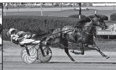
World Of Gaming