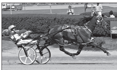
Spider Man Hanover