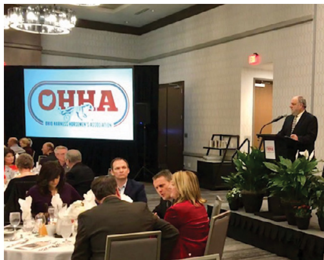
2020 OHHA Annual Banquet

Traditionally, the OHHA annual meetings are held in conjunction with the United States Trotting Association District 1 annual meeting. The USTA