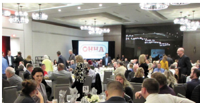
2020 OHHA Annual Banquet

The stallion auction to benefit P.A.C.E.R. will be held online this year. Final preparations are being made and full details will be announced in the coming days.