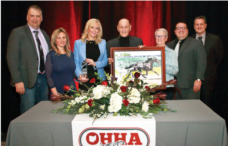
2019 Horse of the Year, Elver Hanover's Presentation