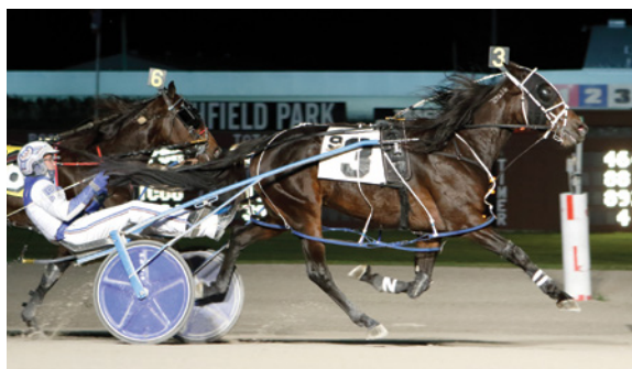
Mr. Ds Rock