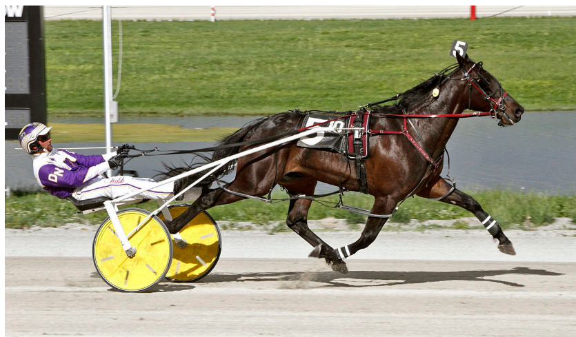
Ohio Sire Stakes May 2 nd .