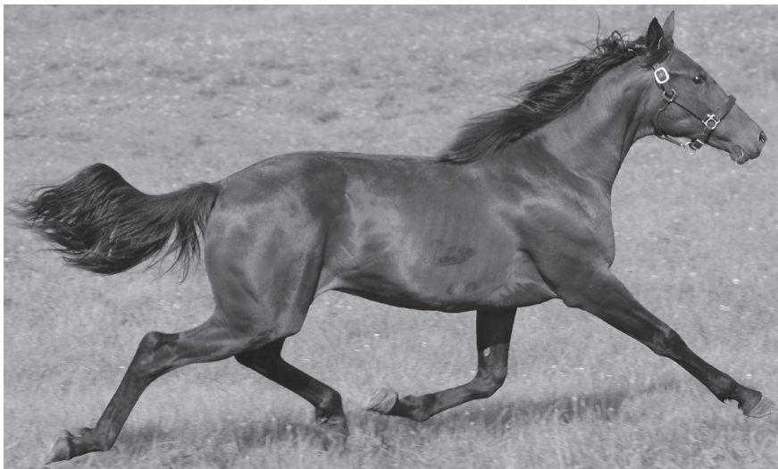
Cassius Lane Cash Hall - Winning Colors K